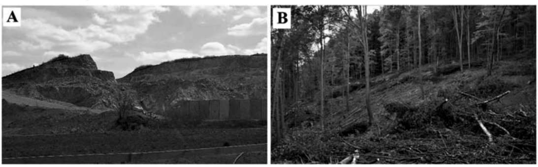
Figure 3 Significant impact of mining in the country at the local level

Goal: to teach students to work with relevant literature, but also with various Internet resources. Another goal is to teach students to write professional texts, select information and work with it, as well as present it. Age group: high school students (16-17 years). Tools: sources of historical information for each municipality individually, sources of current information (municipal monographs, files, PHSR [Economic and Social Development Plan]), documents, communication with relevant public administration authorities), geographical atlases, recommended websites for national and international databases. The activity procedure: the students' task is to implement their global thinking and knowledge at the local microgeographical level within a specific state. Everyone's task is to choose one municipality with a significant mining industry (urban or rural seat) and elaborate its complex geographical characteristics in the form of a seminar paper and create a project for it, which will present the basic natural and socioeconomic specifics of the given municipality with a focus on selected mining problems (see Figure 4). Students should have enough time (min. 2 months) to prepare, with the condition of using relevant literature, but also various internet sources.