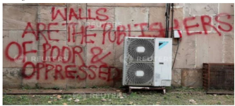
Figure 5 Writing on the Wall