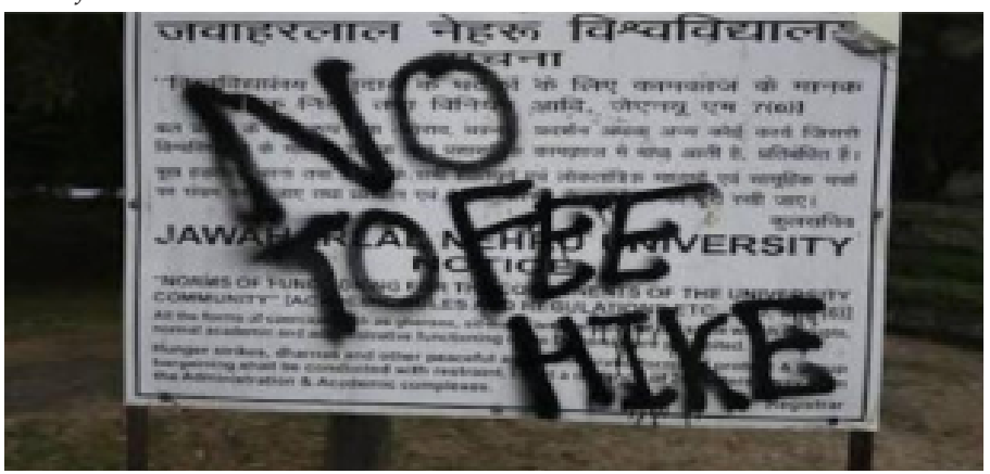
Figure 2 No to fee hike