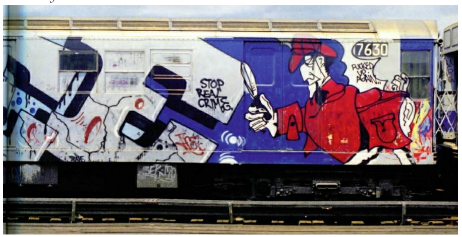
Figure 1 Trains by Lee

making their words bolder and more noticeable that would capture the attention of the people. Crucially, this was a bottom-up development.