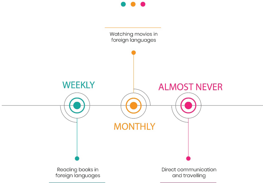
Fig. 2. Contact with foreign language.